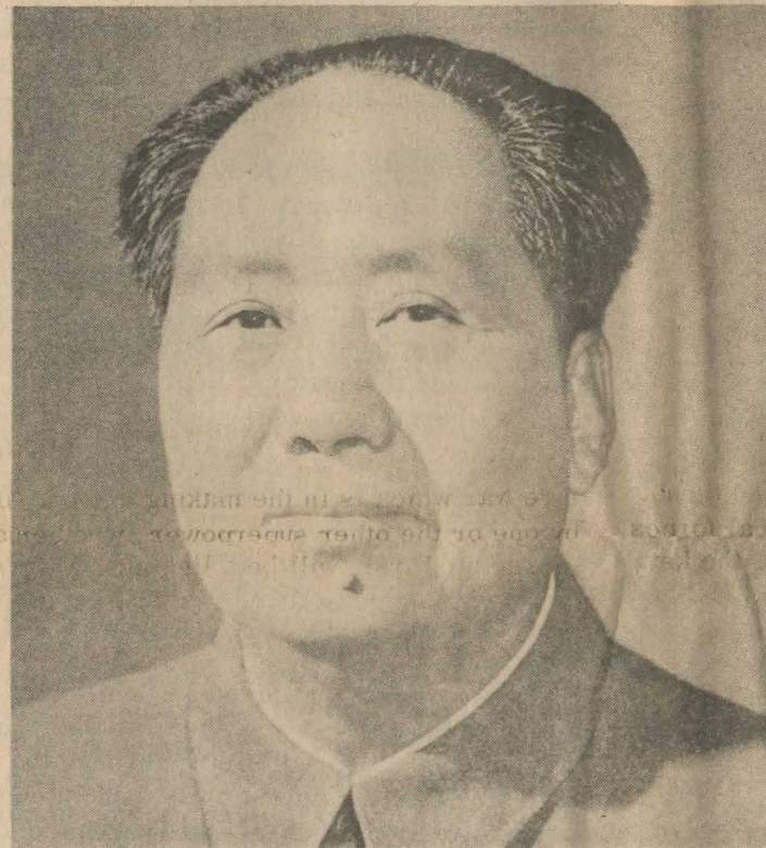
Comrade Mao Tsetung, Late Chairman of the Central Committee of the Communist Party of China and Leader of the International Communist Movement

"PEOPLE OF THE WORLD, UNITE AND DEFEAT THE U.S. AGGRESSORS AND ALL THEIR RUNNING DOGS!"