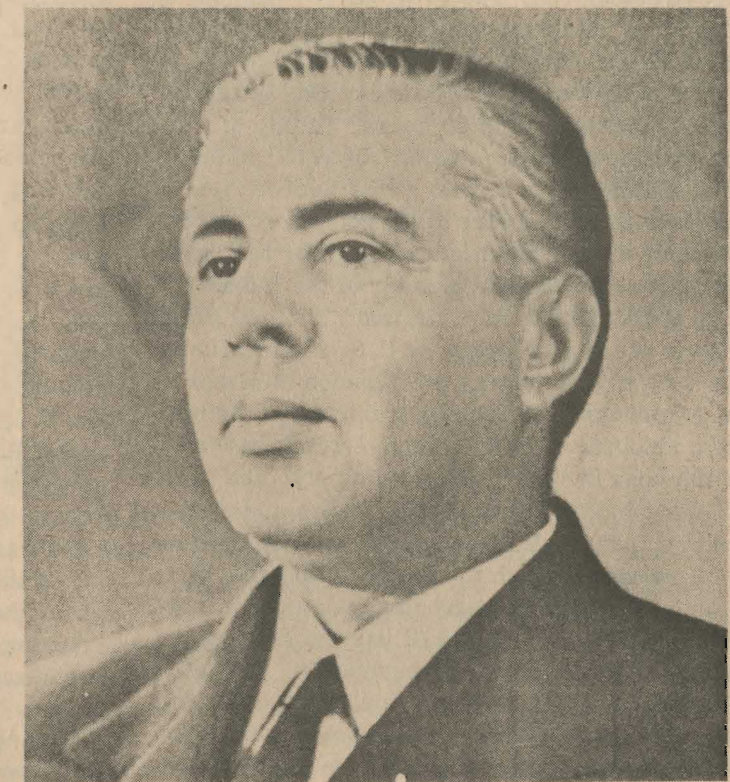
Comrade Enver Hoxha, First Secretary of the Central Committee of the Party of Labor of Albania and Leader of the International Communist Movement

From Comrade Enver Hoxha's Historic Report to the 7th Congress of the Party of Labor of Albania, November 1, 1976.