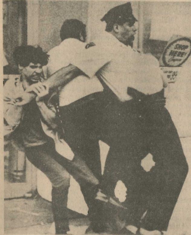
ACWM(M-L) cadre wages militant resistance struggle against the fascist police in the anti-hard-hat demonstration, July, 1970.

The Regina Conference brought to the U.S. the concrete application of Mao Tsetung Thought to the conditions of North America. The Regina Conference, in fact, was the First Conference of North American Marxist-Leninists. It promoted the building of revo-