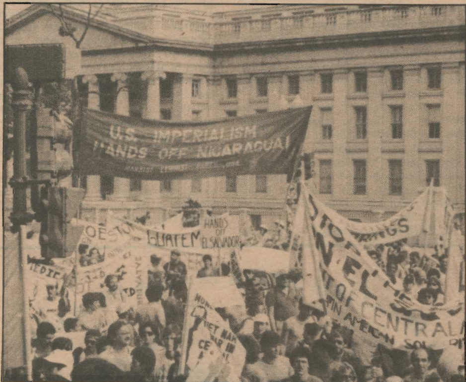
9,000 march in Washington, D.C. to protest U.S. aggression in Central America, July 1983.

Solidarity With the Nicaraguan Workers and Peasants! Support the Nicaraguan Workers' Press! □