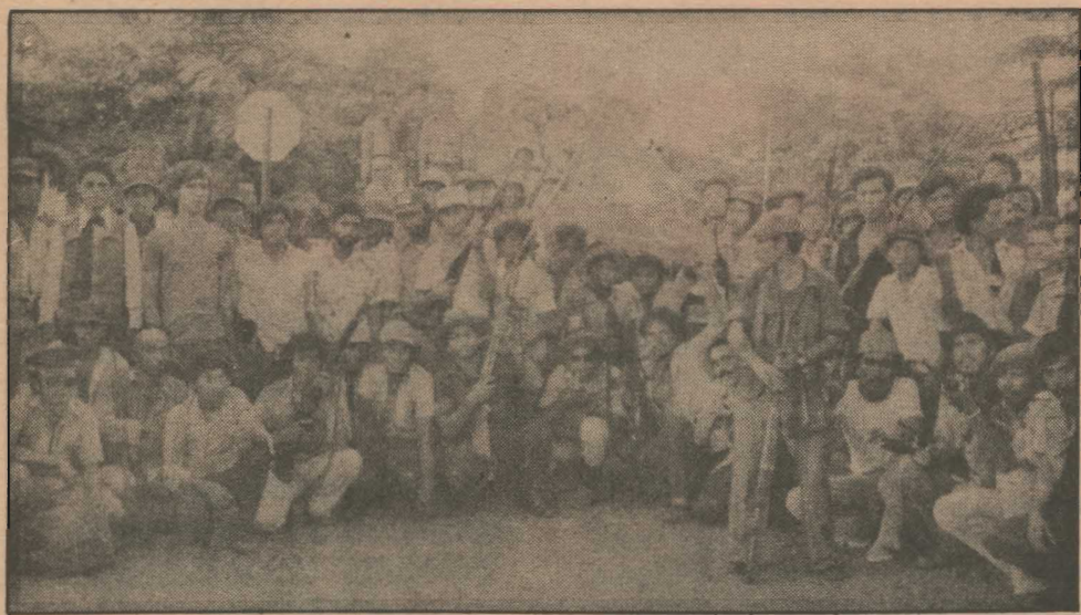
One of the columns of the Popular Anti-Somoza Militias (MILPAS), led by the Nicaraguan Marxist-Leninists, that participated in the liberation of Managua from the Somoza dictatorship in the 1979 revolution.

diction with the U.S. can be resolved. Among other things, on the front page of Barricada you will find glowing praise for the American capitalist politicians of the Democratic Party. It even finds opportunities to praise such rabid imperialists as Daniel Patrick Moynihan. The two-faced gentlemen of the Democratic Party are portrayed as friends of the Nicaraguan people who are supposedly doing their best in Congress to stop the U.S. war on Nicaragua.