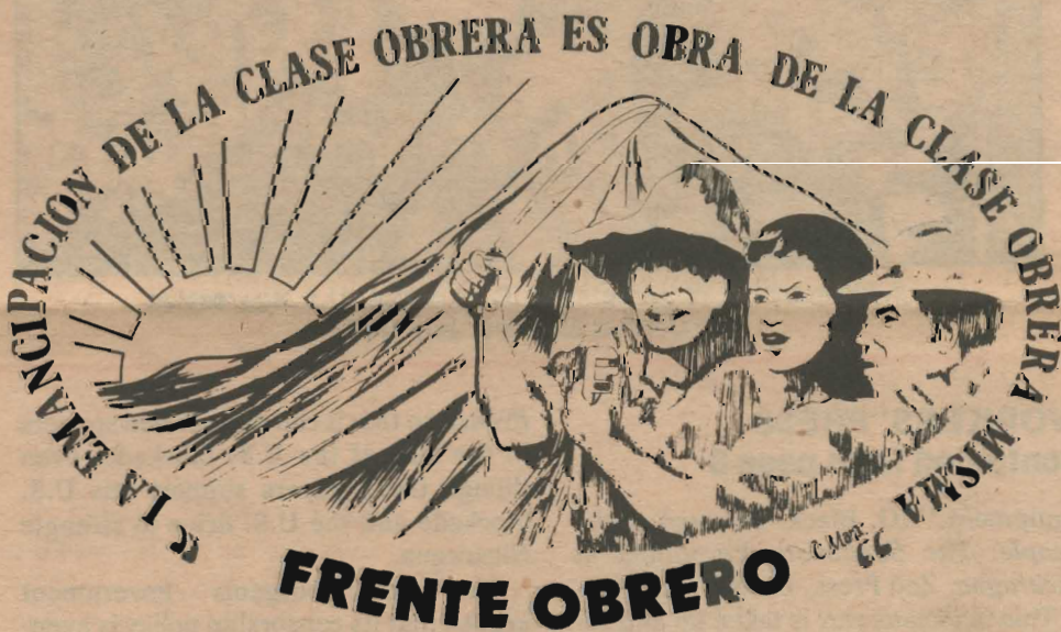
The seal of the Frente Obrero. It carries as its legend the words of Karl Marx: "The emancipation of the working class is the work of the working class itself."

MAP-ML will use the rights it has gained to step up its work in defense of the class interests of the toilers and for their independent organization. □