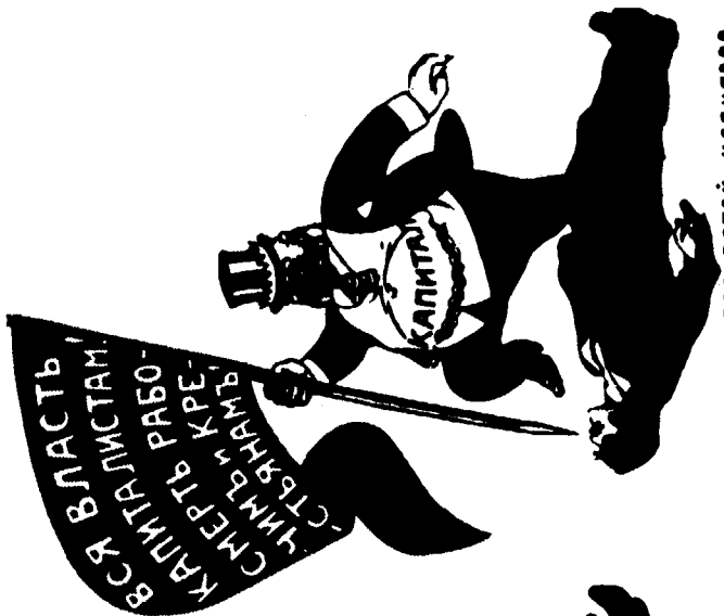
НАМ СМЕРТЬ БОА ПРАТОН КАПИТАЛА