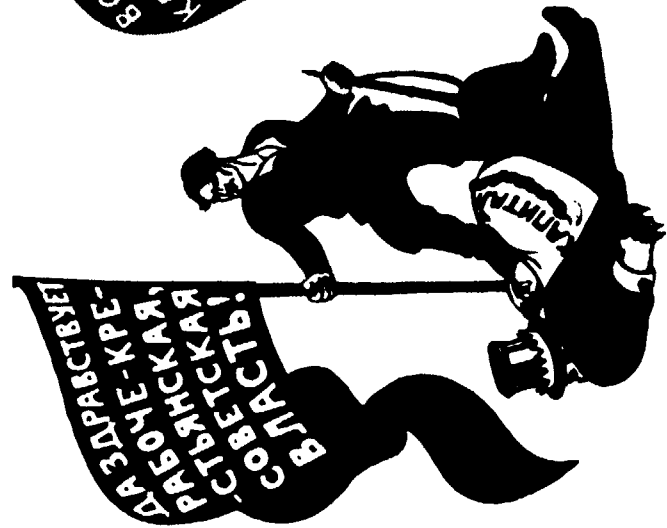
НАМ СМЕРТЬ КАПИТАЛИЗМА.