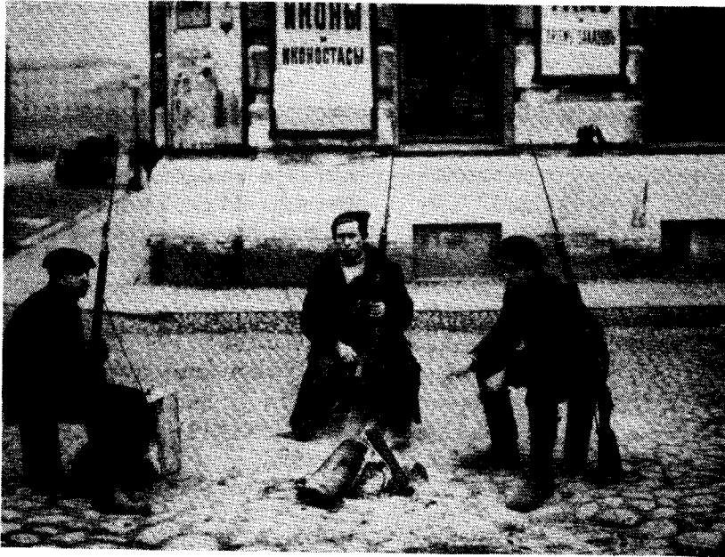
A Bolshevik workers' Red Guard patrol, November 1917

T he beginning was only some 120 years ago. A handful of revolutionaries led by Karl Marx started the struggle to bring about a proletarian dictatorship, a battle to make the working class the ruling class in society,