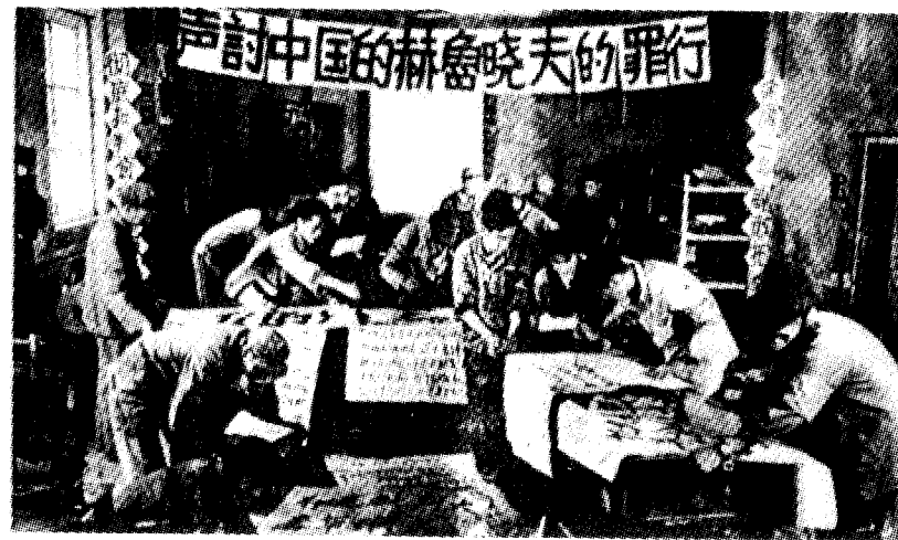
Chinese textile workers preparing posters denouncing capitalist practices in their socialist factory

Both inside and outside the Party there must be a full democratic life, which means conscientiously putting democratic centralism into effect. We must conscientiously bring questions out into the open,