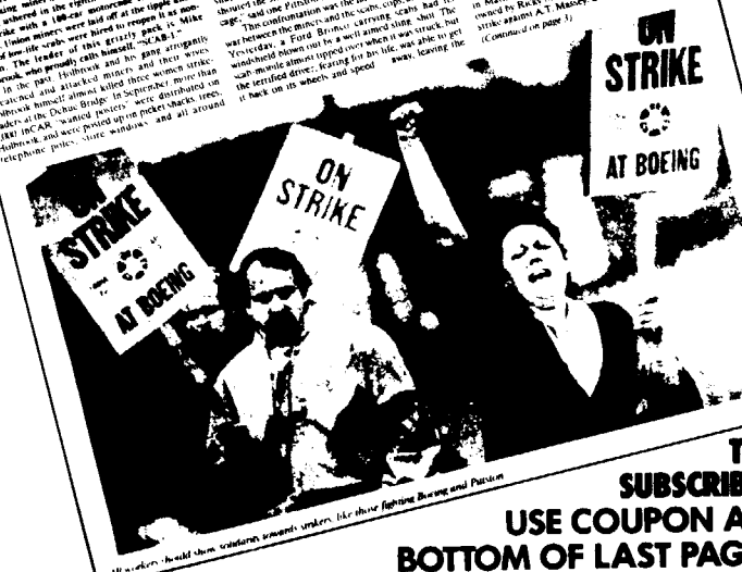
All workers should show solidarity towards strikers like those fighting Boeing and Pittston