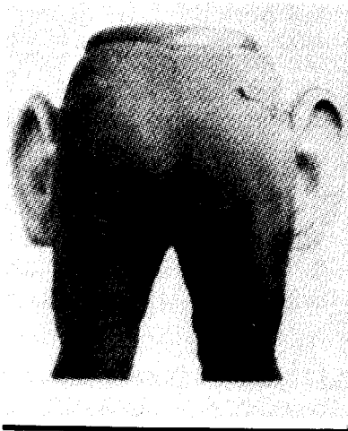
Official U.S. Spokesman

These developments underscore the increasing need to rebuild an international communist movement; understanding them is vital.