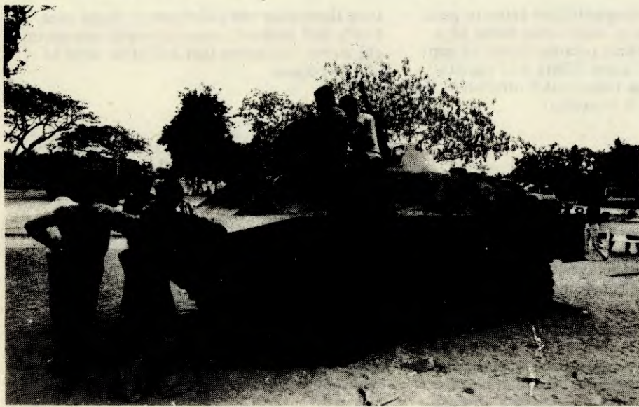
Armored vehicle captured from social-imperialist mercenary forces.

The war in Angola shows that superpower contention is rapidly becoming more acute. The struggle of the superpowers over Angola is highly significant, because it shows the deepening of their mutual contradiction, and the development of their relative strength. It is important to study their actions in Angola in order to be more capable of combating them.