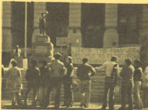
Atlanta Committee Against the Bakke Decision rally at Georgia state capitol on October 15, 1977.

Earlier in the month, the Black American Law Students Association organized nationwide demonstrations against the Bakke