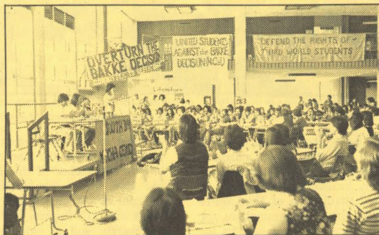
Over 300 individuals and groups from throughout California united to form the ABDC in San Jose on June 26, 1977.

The ABDC has its roots in the grass roots organizing activity that has taken place on campuses, communities, and workplaces in California throughout the year.