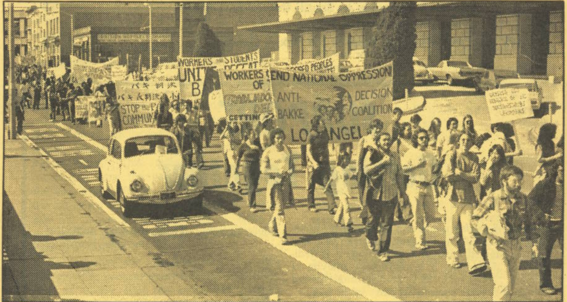
October 15, 1977 march sponsored by the ABDC stretched for 20 blocks through the streets of San Francisco with contingents from all parts of California.

SMASH THE BAKKE DECISION! DOWN WITH IMPERIALISM! END NATIONAL OPPRESSION!