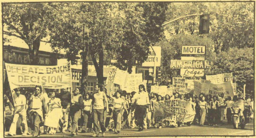
Militant march by the ABDC and MEChA's through the Black, Chicano and Asian communities of Sacramento on Sept. 17, 1977.

The marchers leafletted the communities, held rallies, organized presentations, and did extensive outreach along the march route, which extended through Fremont, Niles, Livermore, Stockton, Lodi and Sacramento.