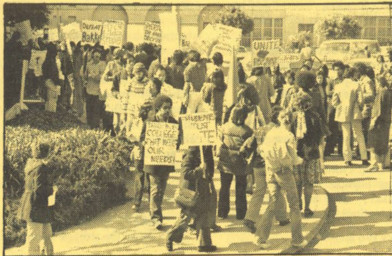
Militant chants of "Colluding with the Courts to Attack our rights, UC Regents we plan to fight" rang throughout the picket line sponsored by USABD on May 20, 1977.

is just a continuation of their reactionary stand."