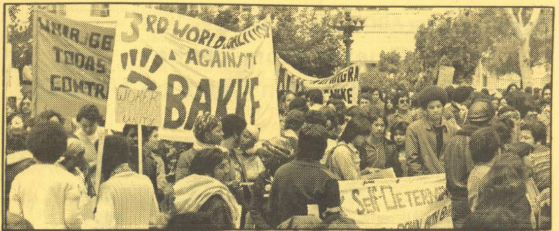
2,000 students, workers, community and revolutionary groups joined the statewide MEChA's in protesting the Bakke Decision in Los Angeles on May 7, 1977.

And since the Bakke decision also threatens affirmative action and other related programs for women, we must link it to the struggle for women's equality , including demands such as against the forced sterilization of Third World women, for equal hiring and promotions for women, for pregnancy and other benefits for women workers, and day care for working and Third World women.