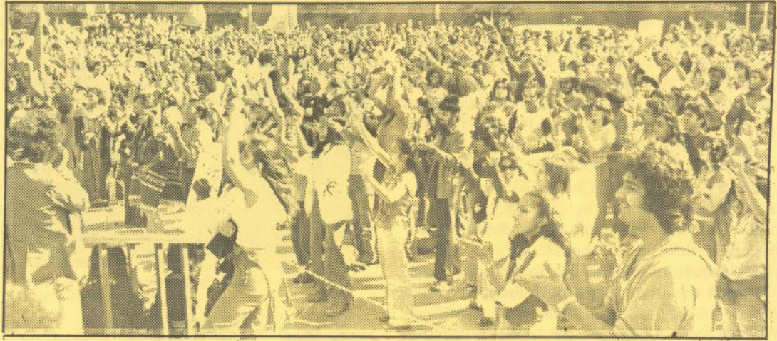
4,000 people demand "Smash the Bakke Decision" and "End National Oppression" at the San Francisco Federal Building on October 15, 1977.

all walks of life, uniting together to bring forth their demands. Each had come to San Francisco with a clear determination to smash the racist Bakke decision and build the struggle against each and every instance of national oppression.