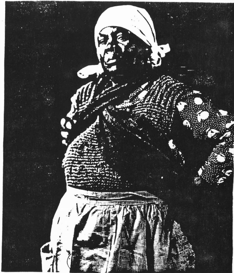
AMILCAR CABRAL/PAUL ROBESON COLLECTIVE(M-L)