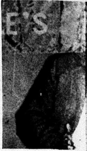
Hardial Bains - Eglinton