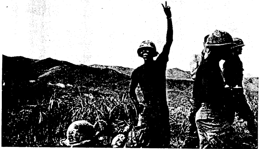
GIs during Vietnam War - many fragged their officers and refused to fight the "enemy."

Thirty years of war had done something for these rats - made them tougher, better able to compete with man. Watching the war-zone rats, it seemed to me that the rats would eventually claim this planet after the devastation of war and garbage got to be too