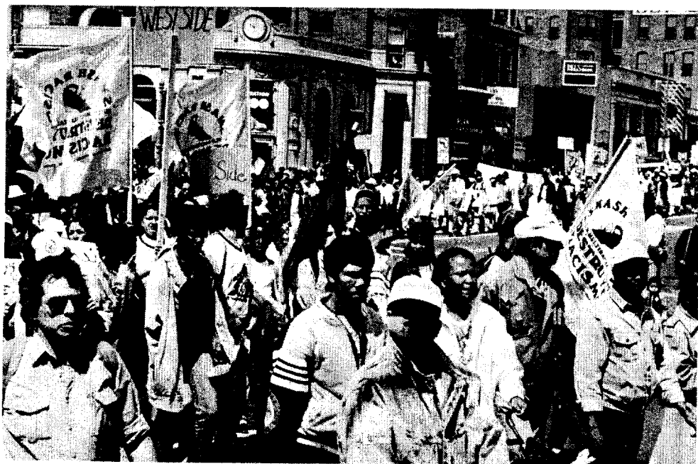
PLP is building a movement of workers, soldiers and students to crush the imperialist warmakers.