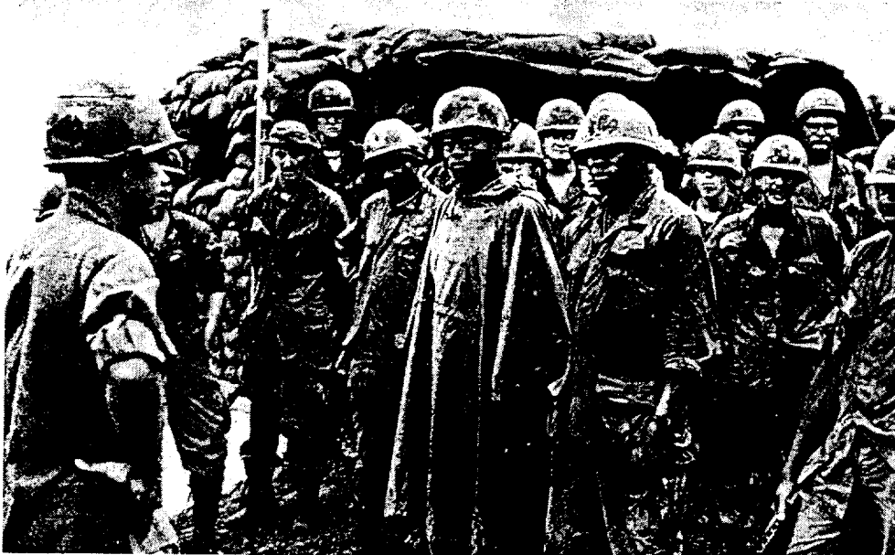
GIs during Vietnam War.

"Asshole dinks, tryin' to do us when we're doin' a