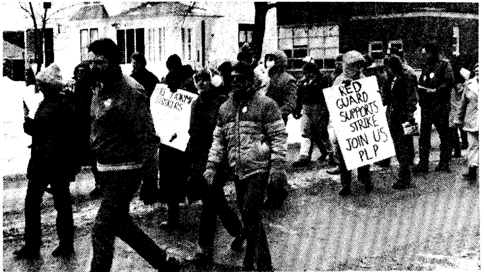
Austin, Minn. — In 1986, PLP members in the National Guard marched in support of Hormel strikers.

The truth is that around the Party there are a lot of young people who we have been talking to about the military work. Within some of them there's a certain fear of being repressed for organizing for communism. It was just then when ex-soldiers who had joined the Army spoke about their past experiences organizing in the Army. In the Army the soldiers are mistreated, overworked and discriminated against,