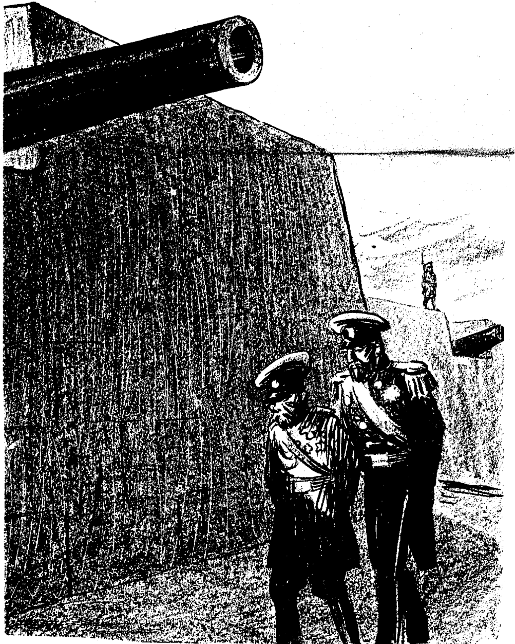
Cartoon about World War I

Russian Officer: "Why these fortifications, your majesty? Surely the Germans will not get this far!" The Czar: "But when our own army returns...?"