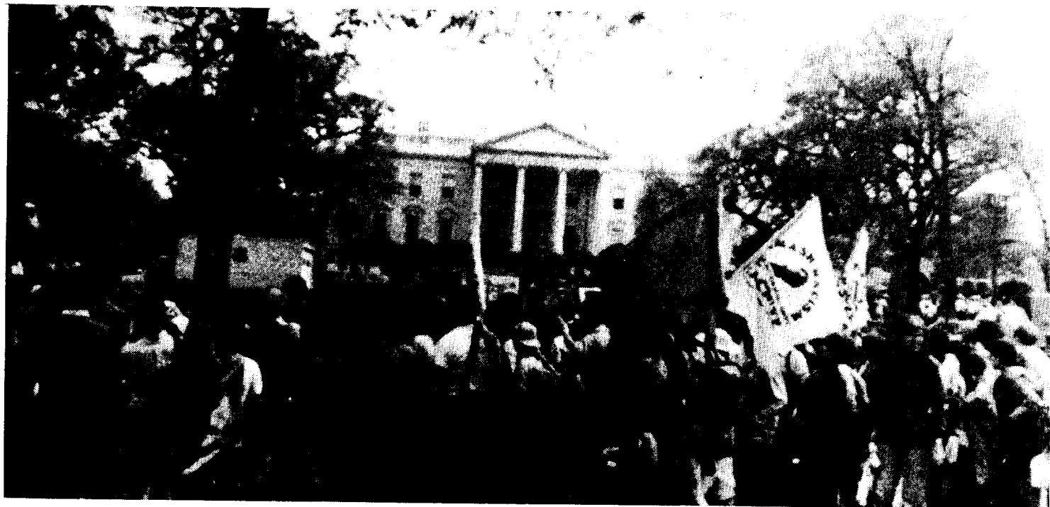
1985 PLP protest against imperialist warmakers in front of the White House.

In our next issue, PL Magazine will continue the series on the Revolt of the Black Sea, by French soldiers sent right after World War I to invade Russia to try to crush the Bolshevik Revolution.