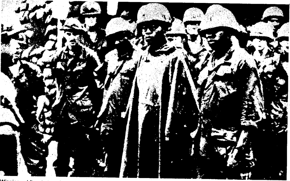
Winning soldiers to turn their guns against the warmakers is key to make a communist revolution.