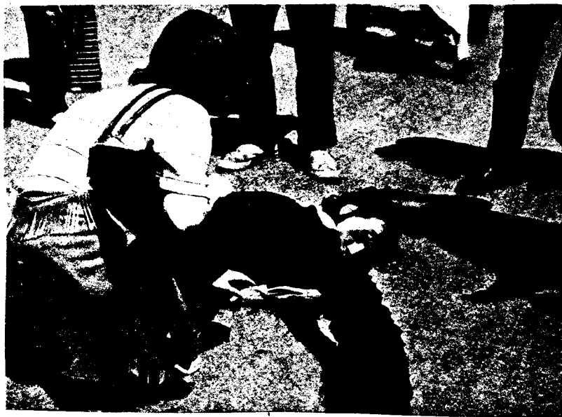
Another victim of U.S. Imperialism killed in blood-bath at Kent State University

themselves to be led by the mass media into believing that white Americans are indeed waking up, for Kent State indicated what happens when the power structure allows its guardsmen to be under trained and young, it was an accident and it won't happen again accidentally. Eventually, the state will justify the deaths of the four Kent students as they have justified in the past the deaths of three Black college students in Orangesburg, North Carolina, civil rights workers in the South, little girls attending Sunday school, Vietnamese mothers and their babies, Arab school children, unarmed South Africans demonstrating in Sharpesville or the wanton slaying of little nine-year-old Danny Smith while he was standing at a bus stop with his mother.