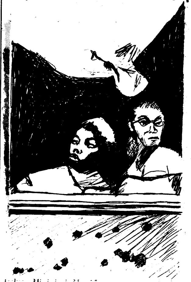
Jackson, Mississippi - May 15 -

State and Local Police opened up without warning with a barrage of gunfire on a five story women's dormitory on the campus of Jackson State University. The wanton attack, which lasted for more than 15 minutes, left two Black youths dead and eleven injured. Three of the injured are reportedly in critical condition in Jackson hospital.