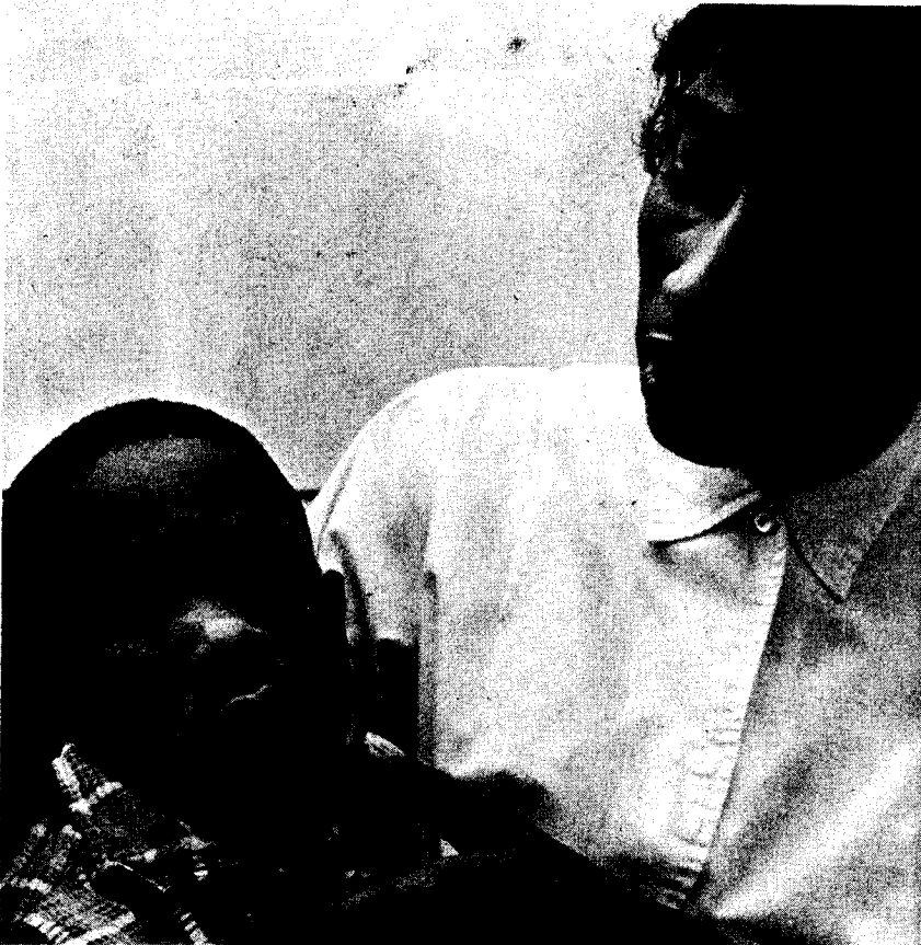
Child mutilated by tear gas can

People United For Community Services are primarily interested in fighting against UCS's trick reorganization, which gives people the impression that they have a greater voice in UCS's policies, when actually they still have no say so.