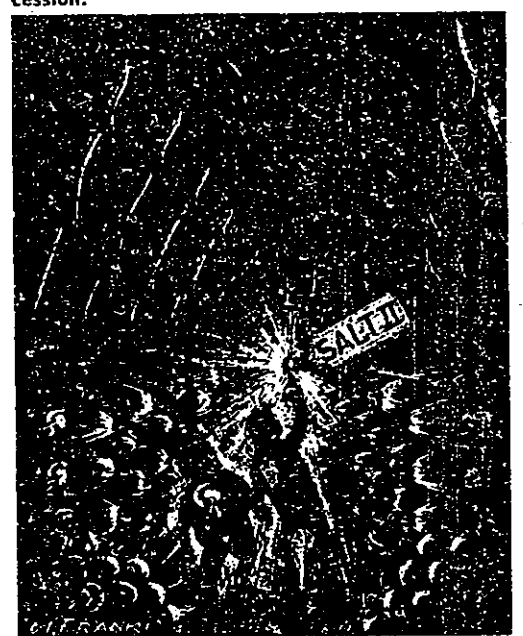
"Better to light one candle rather than curse the darkness, eh Brezhnev, of pol?"

Above all, they know that already they are the victims not only of oil price gouging but the total economy plunging downward. They know that they are suffering from a recession that is already here; no need for them to wait for fall when two back-to-back quarterly declines in the Gross National Product (GNP) will meet the capitalistic-academic criterion for defining a recession.