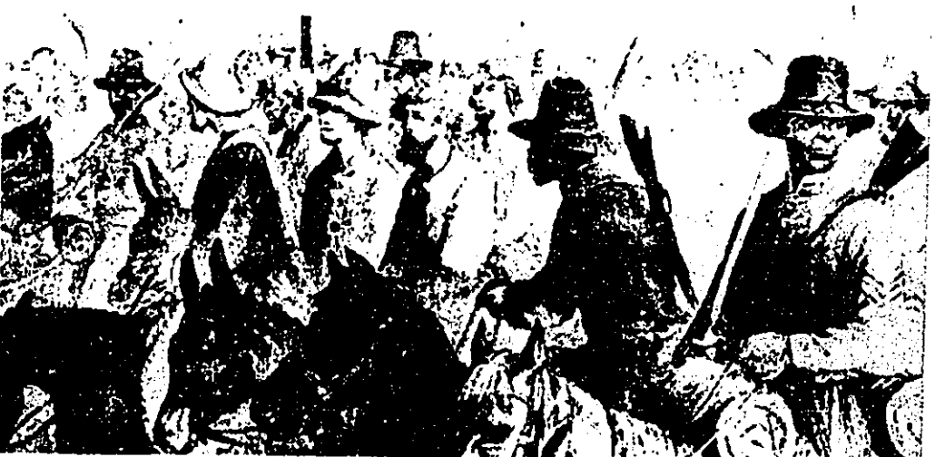
Black cavalrymen bringing in Confederate prisoners