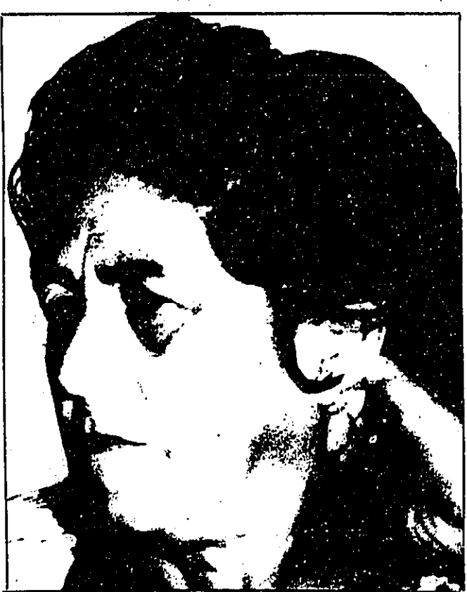
Free Admission Public Invited

"Marx's Relevance to Our Day; Women's Liberation and The Black Dimension"